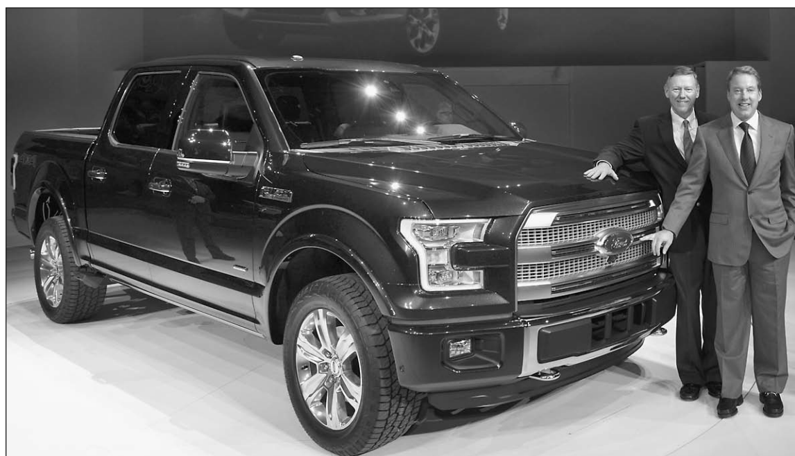
Alan Mulally, left, and Bill Ford Jr. show off the new Ford F-150 at last week's NAIAS at Cobo Center in Detroit.