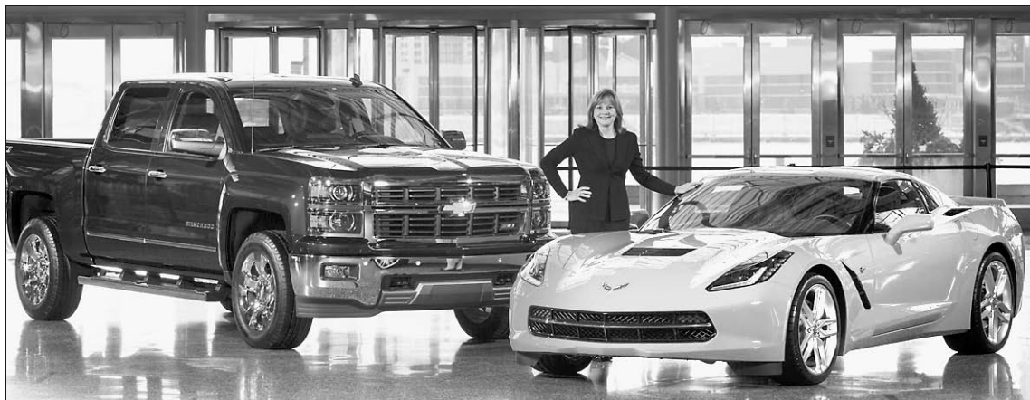
GM's new CEO Mary Barra with Silverado 1500, Corvette Stingray at Auto Show